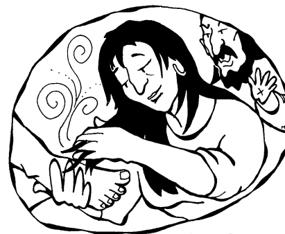
JOHN 12. 1-8