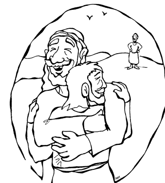
LUKE 15: 1-3, 11B-32